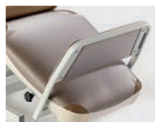
Cover leg segment