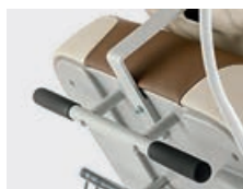
Handle on backrest