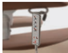
2nd hand switch

Note: The product shown in this brochure contains optional accessories that are not included in the standard version.