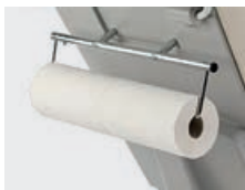
Paper roll holder